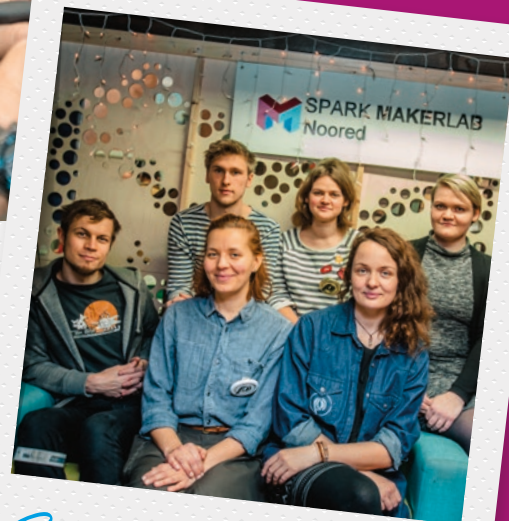
Spark Makerlab team