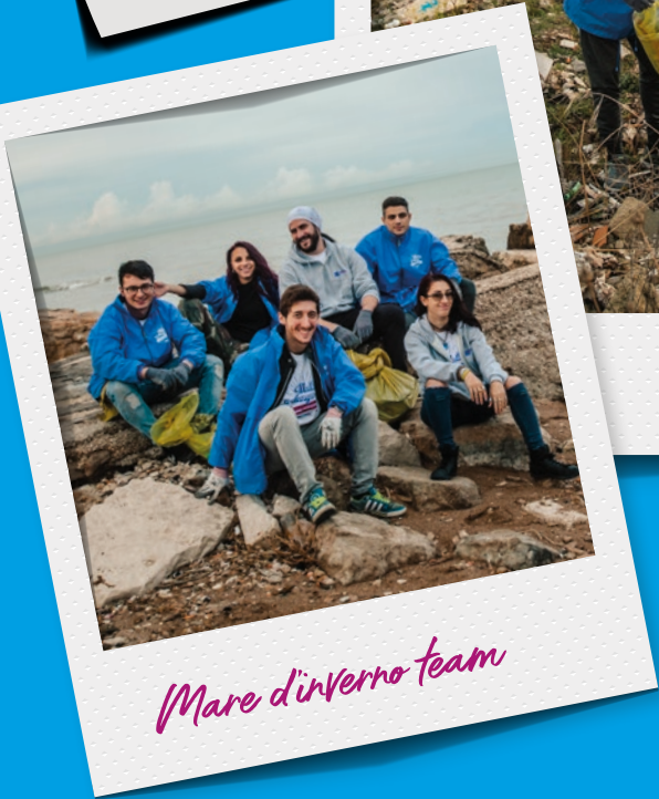
Mare d'inverno team